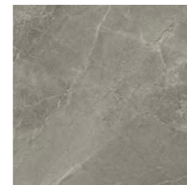
60x60 60x60 R11 20mm