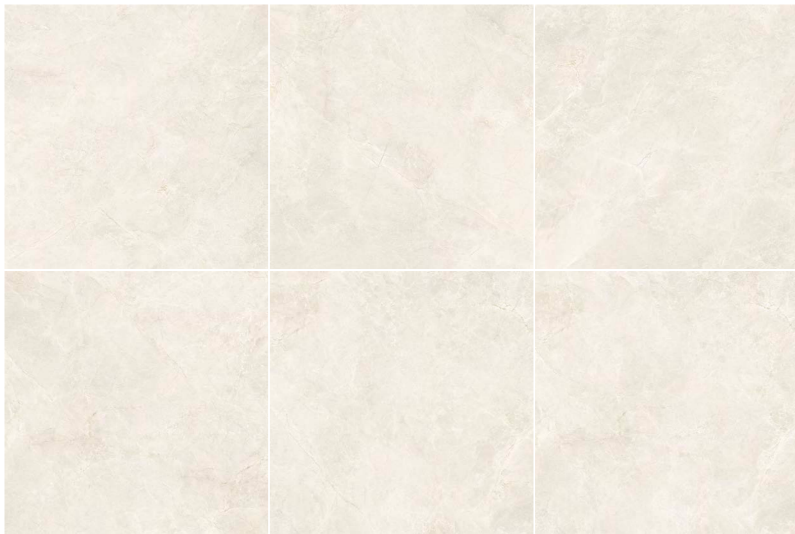
Sviluppo grafico 120x120 · 6 pcs.