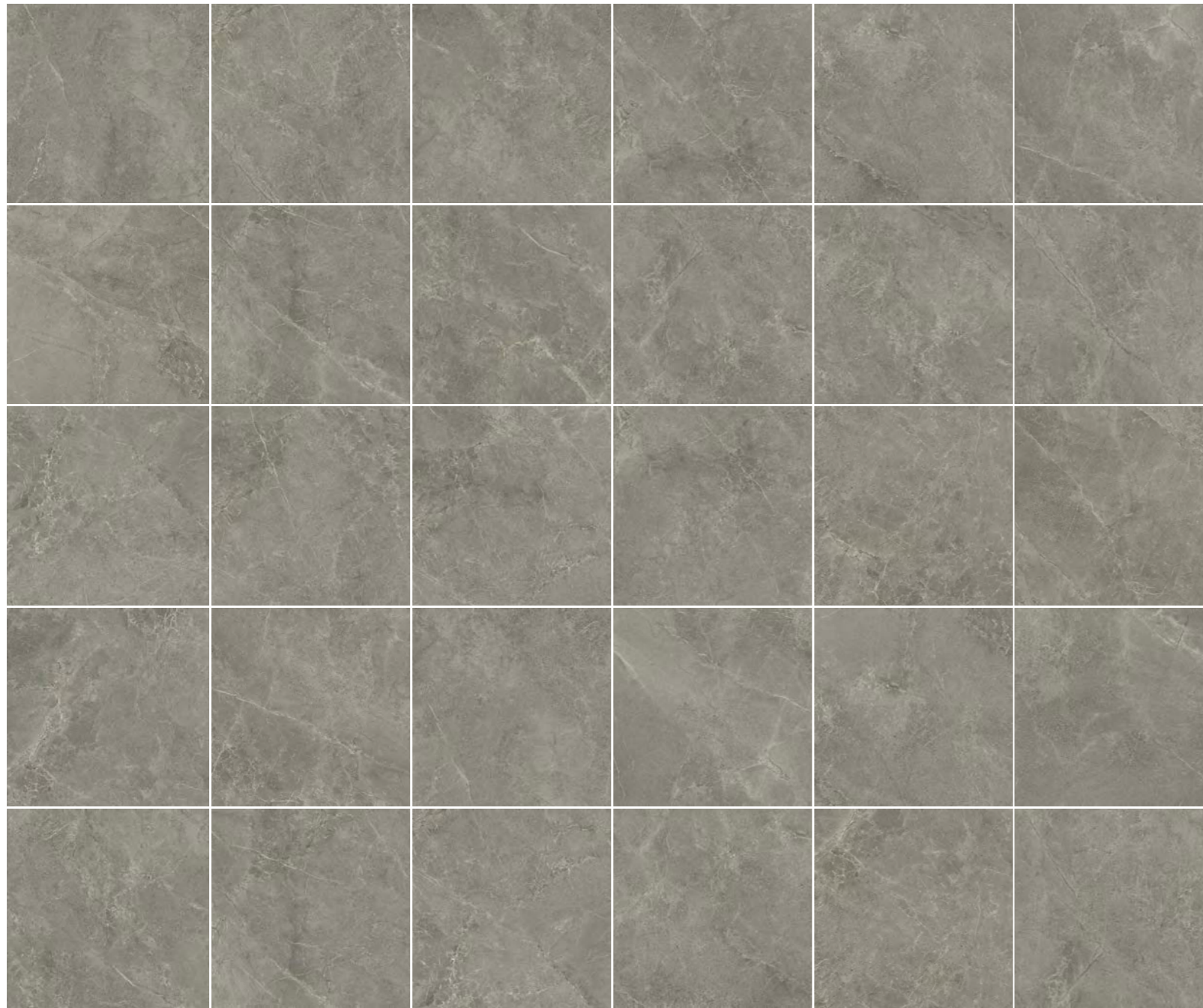
Sviluppo grafico 60x60 · 30 pcs.