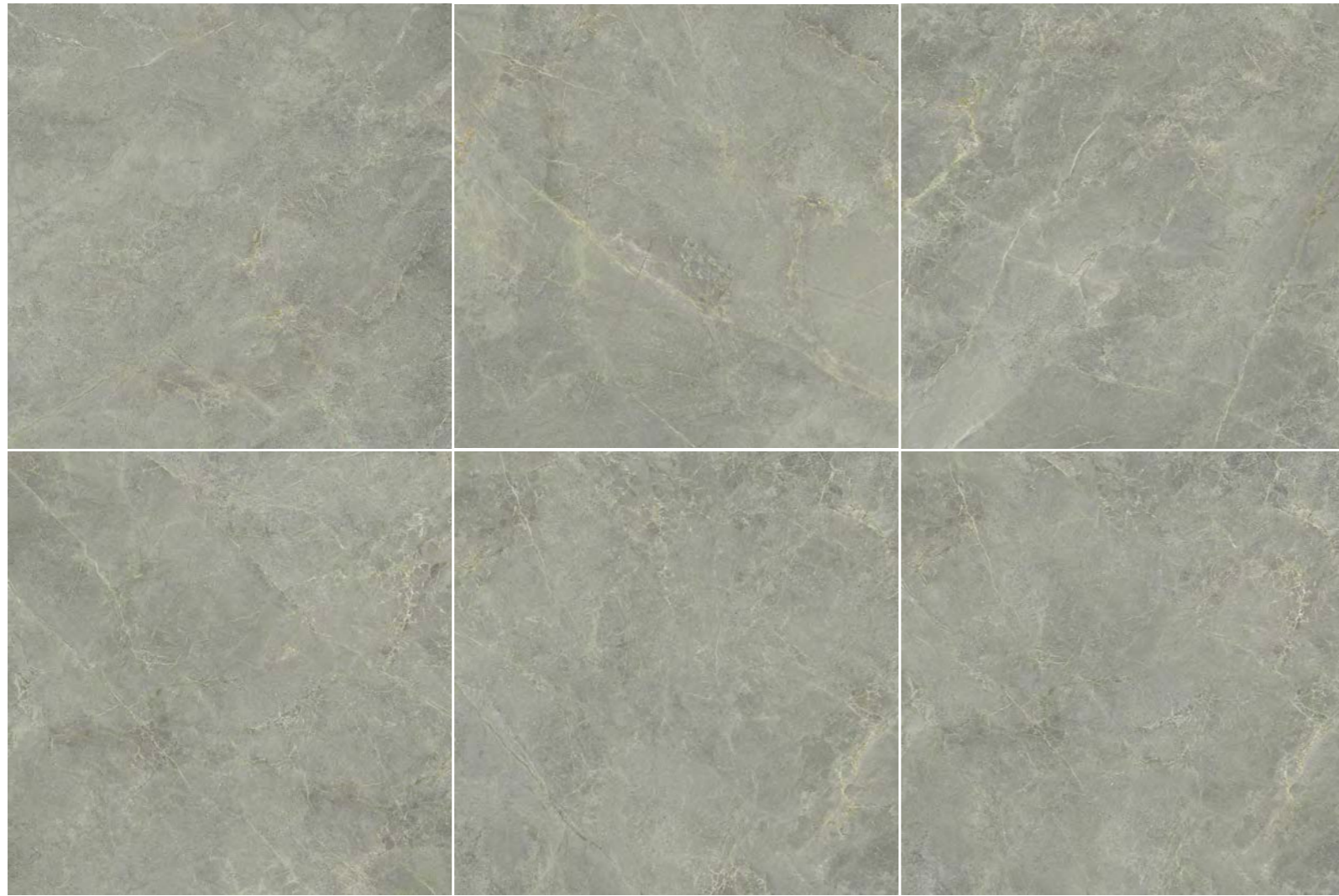
Sviluppo grafico 120x120 · 6 pcs.