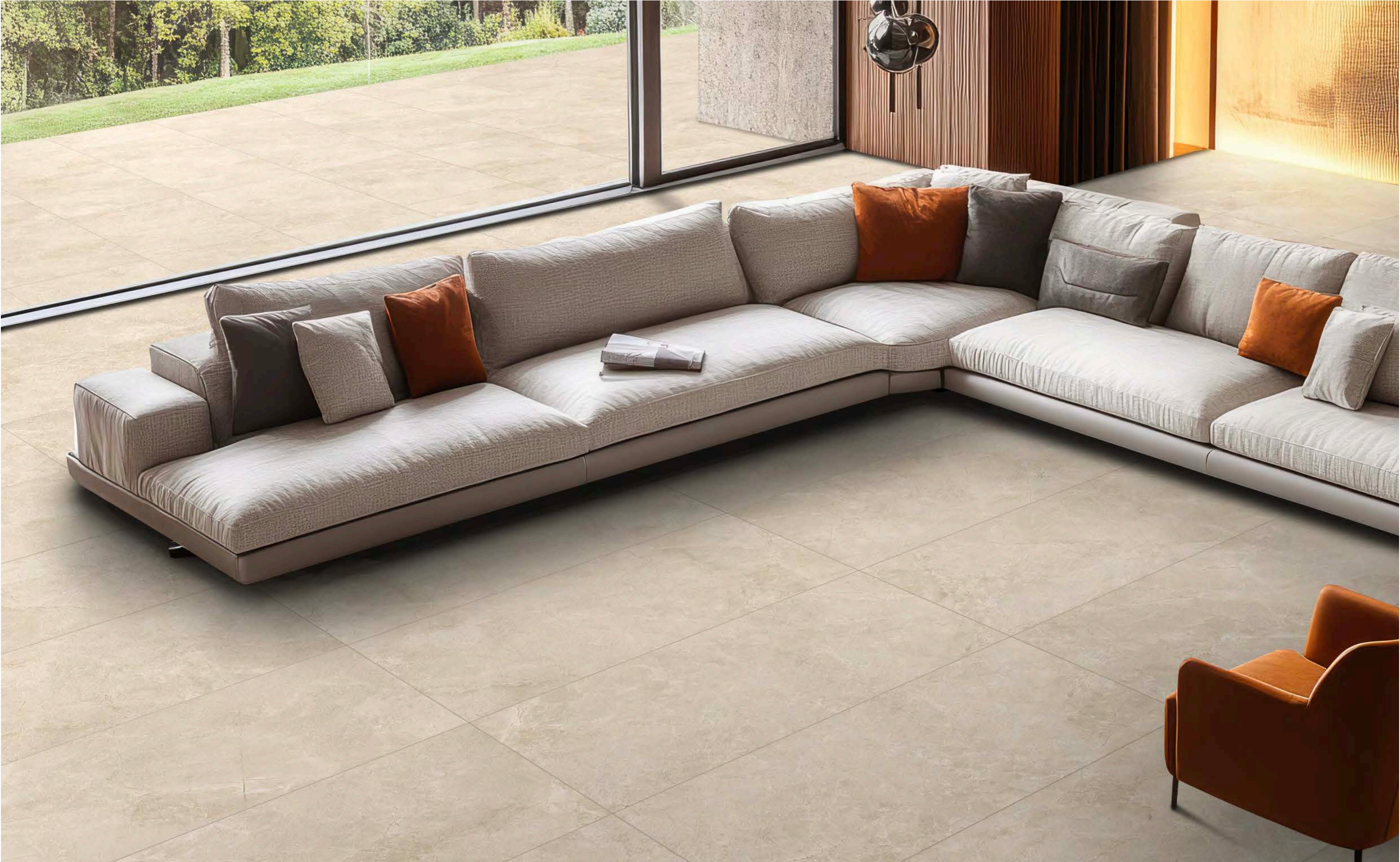
Floor Indoor GS Sand 60x120 · Floor Outdoor GS Sand 60x60 R11 20mm