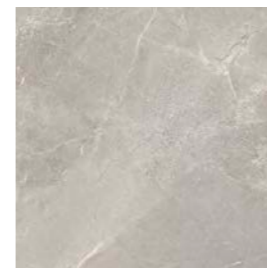
60x60 60x60 R11 20mm