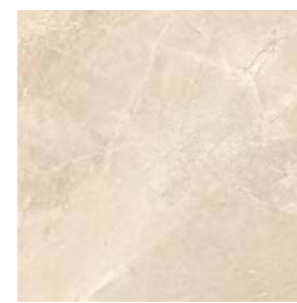
60x60 60x60 R11 20mm