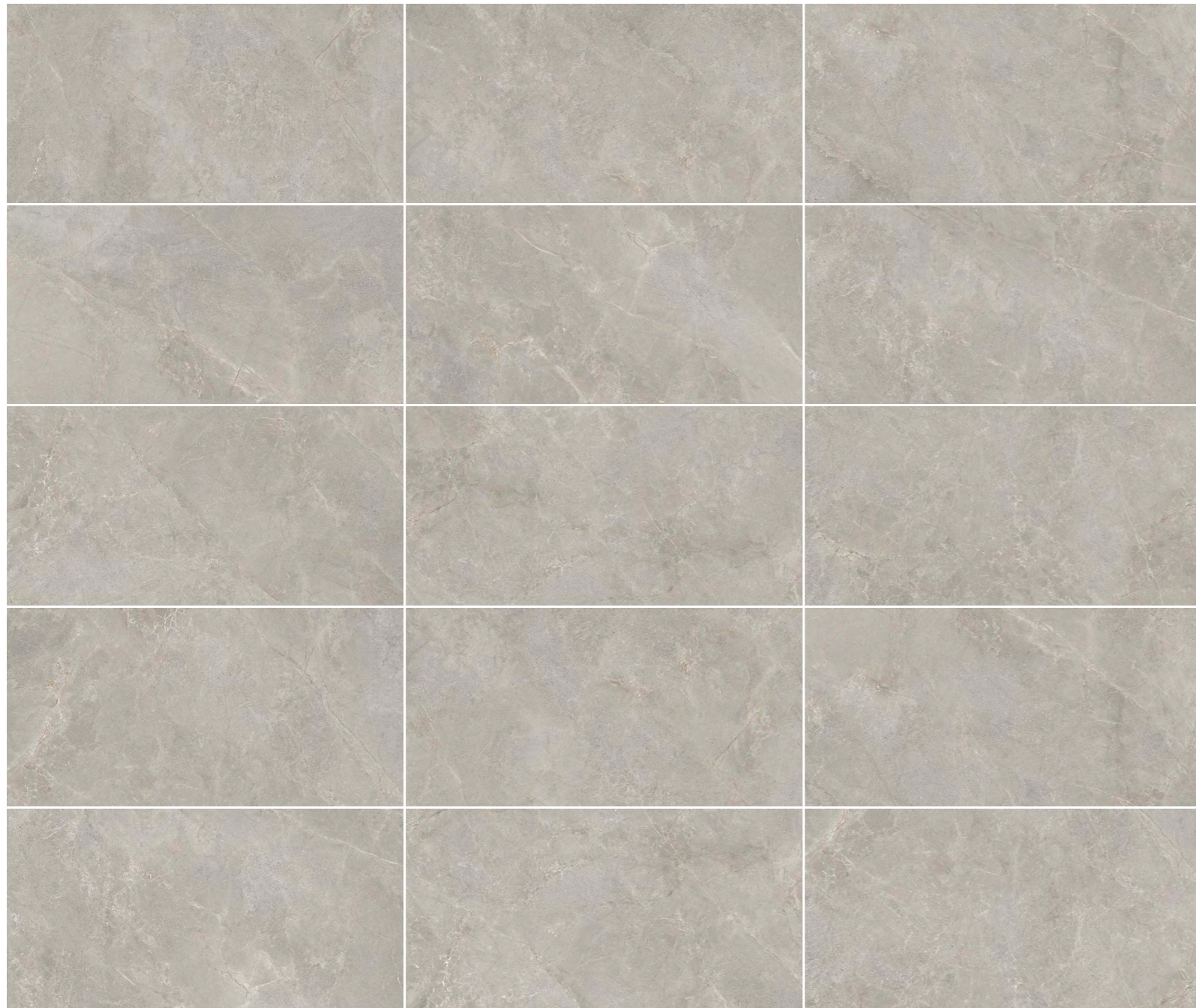
Sviluppo grafico 60x120 · 15 pcs.