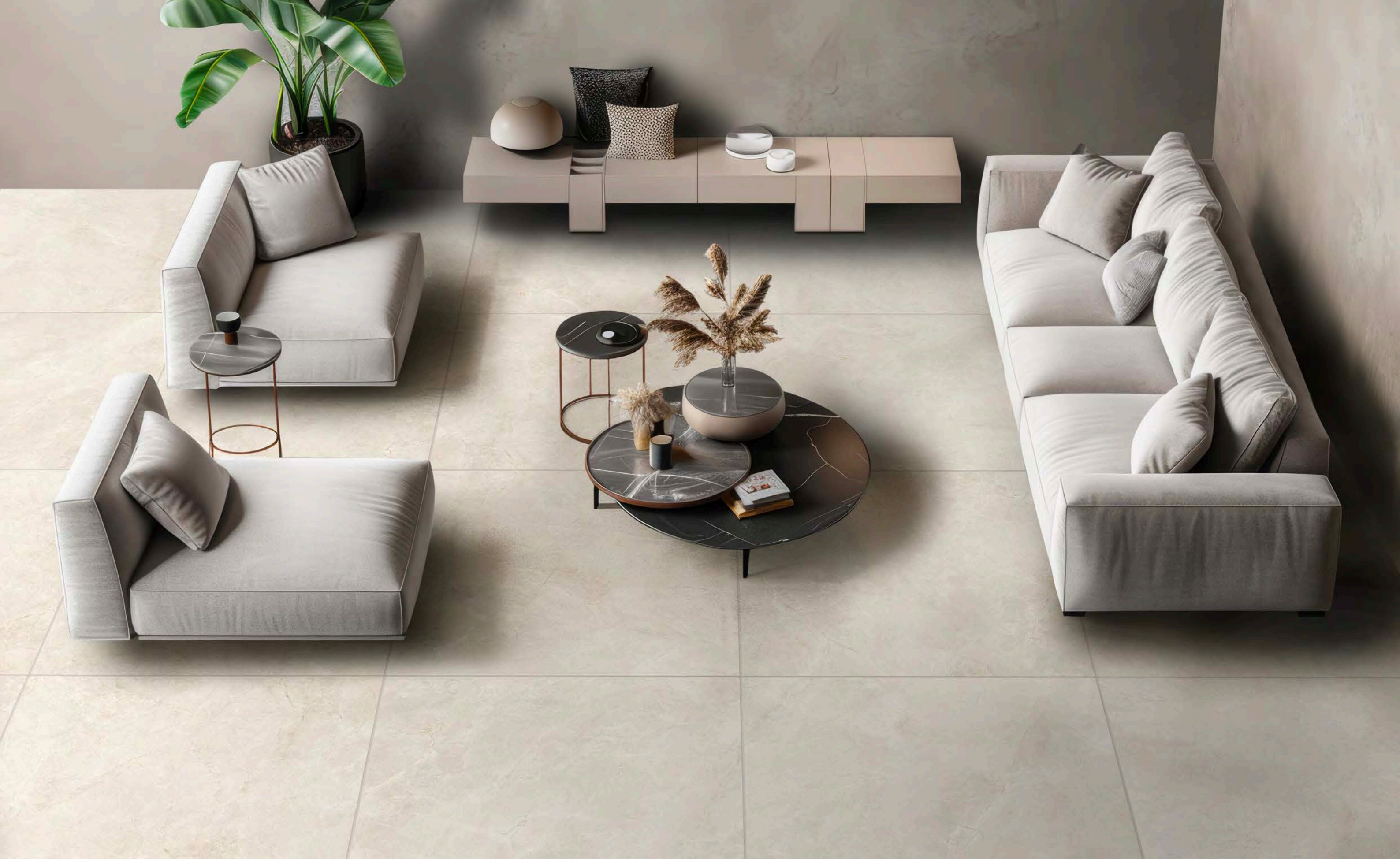
Floor GS Ivory 120x120