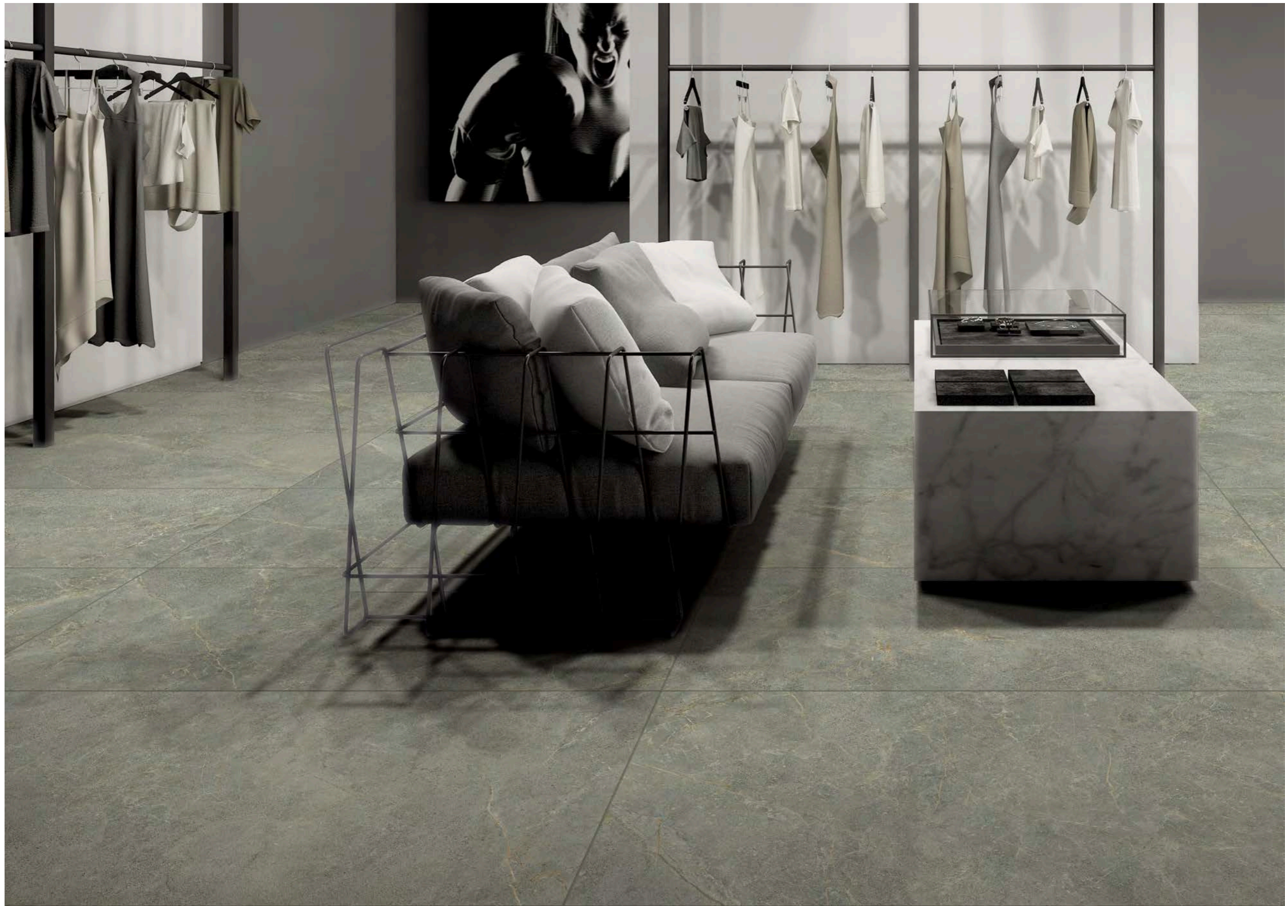
Floor GS Oxid 120x120