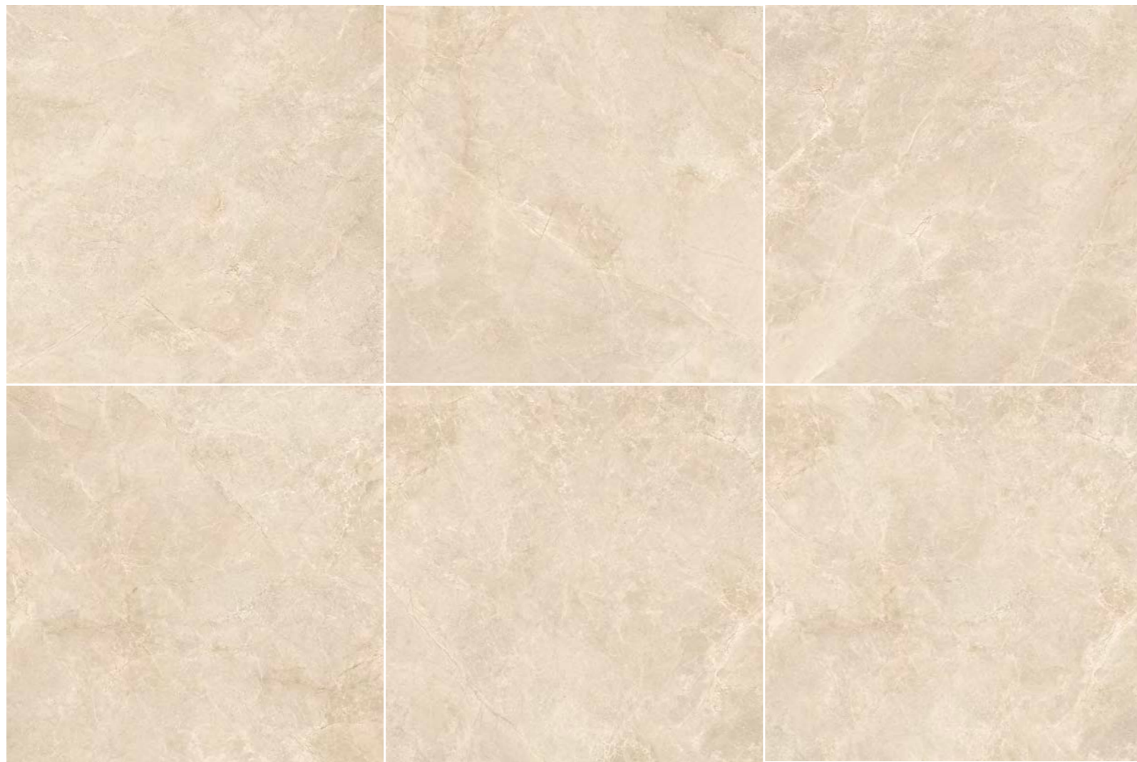
Sviluppo grafico 120x120 · 6 pcs.